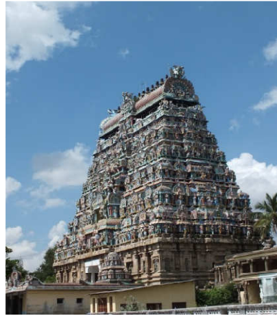
Temple of historical age