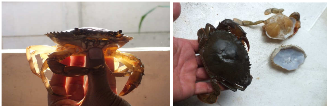
A newly moulted soft shell crab with the old moulted hard exoskeleton (shell)