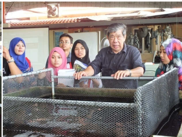
A fruitful trip for the students of UPM at the STAC R&D Aquaculture Centre.