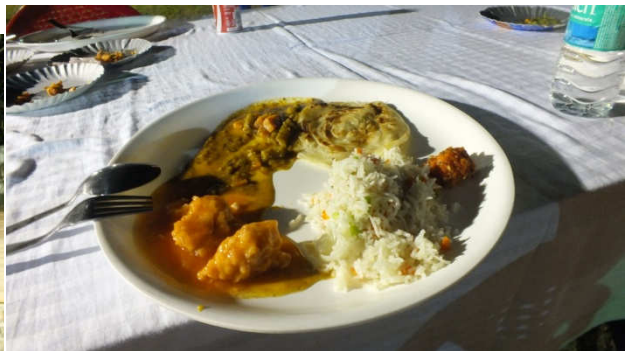
Buffer dinner and culture show for all the participant at the compound of the hotel.