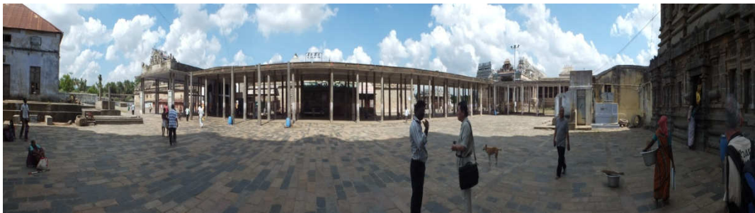
Panorama view of a historical temple on the way back to Chennai.