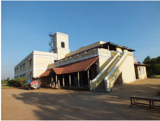
Hotel for the participants

Visited Tourist Spots On The Way Back to Chennai.