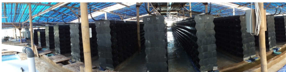
An Innovative Condominium RAS Soft Shell Crab Farming System .