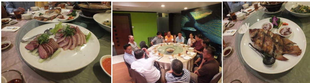
A yummy lunch for all the members of MADA who had attended the annual meeting On 30 th March 2013 at Restoran Seafood Unique 23 at PJ.