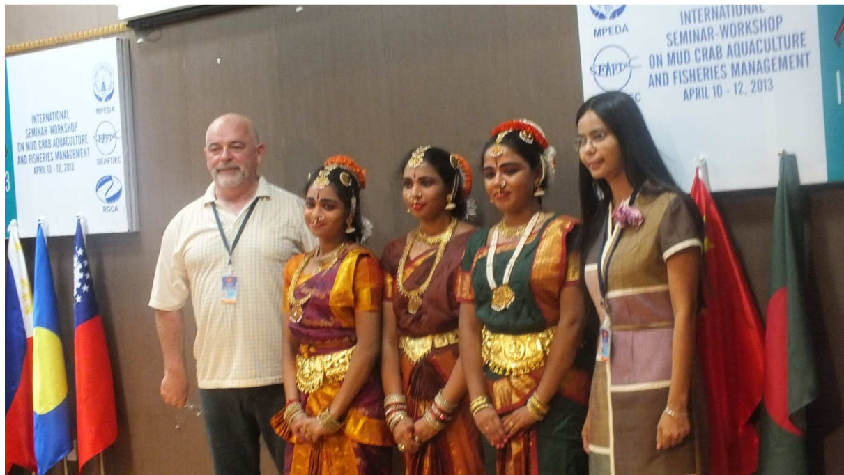
Buffet Dinner and Culture Show with the ending of the 3 days Seminar and Workshop