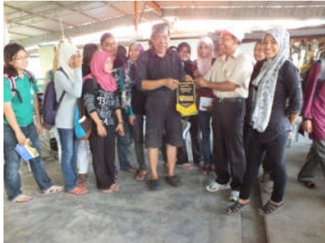
A UPM Souvenir for STAC MD.