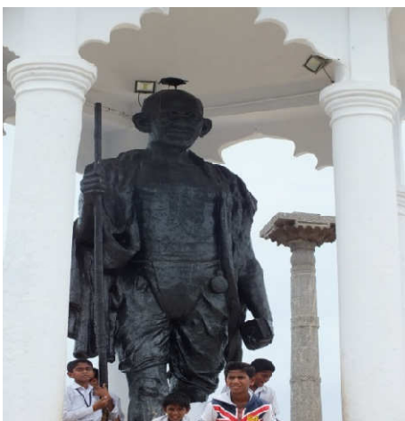
Statue of Gandhi