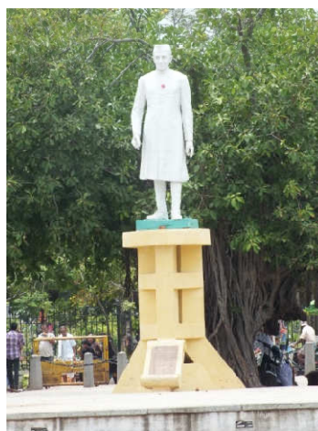
Statue of late President