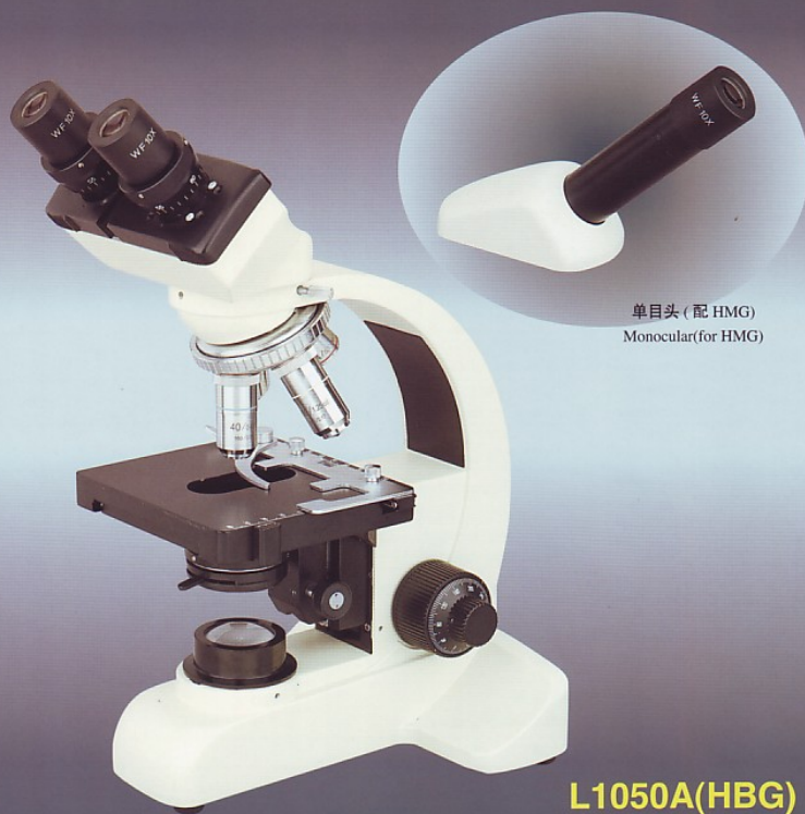
单目头 (配 HMG) Monocular (for HMG)